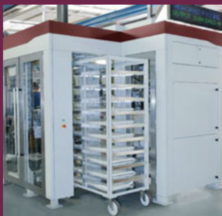
Space-saving vertical empty bag magazine